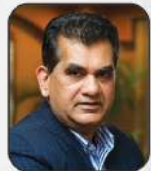
SHRI AMITABH KANT CEO, NITI AAYOG

Shri. Amitabh Kant is presently CEO of National Institution for Transforming India (NITI Aayog) and has been the Chairman & CEO of the Delhi Mumbai Industrial Corridor Development Corporation (DMICDC). He is the author of Branding India-An Incredible Story and has edited "The Path Ahead- Transformative Ideas for India". Shri Amitabh Kant has been a key driver of the 'Make in India', 'Start-up India', 'Incredible India' and 'God's Own Country' initiatives that positioned India and Kerala State as leading manufacturing and tourism destinations. These campaigns have won several international awards and embraced a host of activities – infrastructure development, product enhancement, private-public partnership and positioning and branding based on extensive market research.