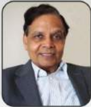
PROF. ARVIND PANAGARIYA

PROFESSOR OF ECONOMICS, UNIVERSITY OF COLOMBIA, USA