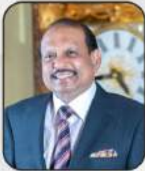
M.A. YUSUFF ALI CHAIRMAN & M.D. LULU GROUP

Mr. Yusuff Ali M.A. ranks among reputed NRI business personalities around the world today. Under his dynamic leadership, Lulu Group has achieved significant growth and diversified into various business lines. The Lulu Group with its headquarters based in Abu Dhabi is one of the leading importers, wholesalers and retailers of all kinds of consumer items with a world-wide business. He was the first and only Indian from the Middle East elected to the Director Board of Abu Dhabi Chamber consecutively for a record third time. In recognition of his remarkable achievements in Business & Industry and his distinguished services in the field of social work, he was conferred prestigious "Pravasi Bharatiya Samman Award" in the year 2005 and Padma Shri award in the year 2008.