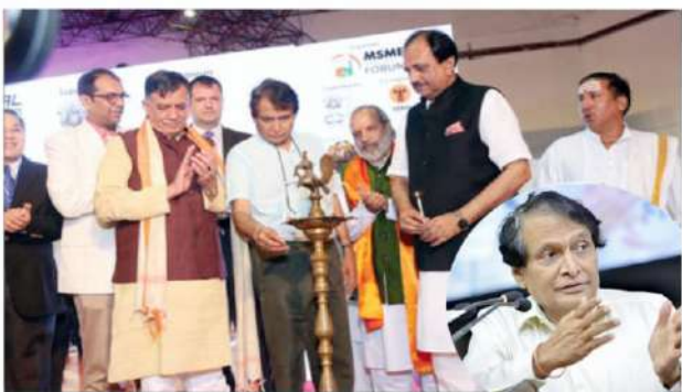
Sh. Suresh Prabhu, Union Minister of Railways, Commerce & Industry with Sh. Satish Mahana, Industry Minister, UP & Sh. Jai Bhagwan Goel Inaugurating 5th Expo