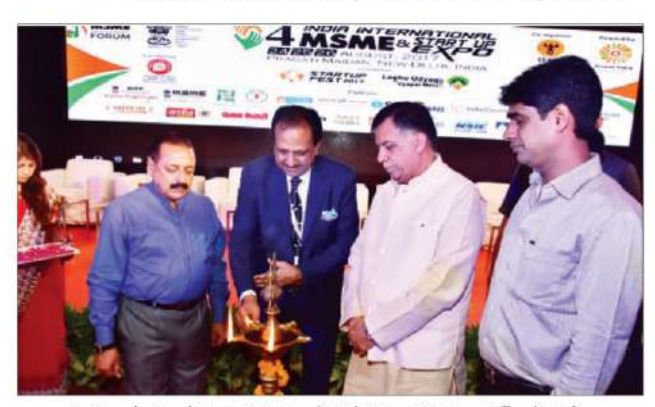
Dr. Jitender Singh Union Minister (MOS), Prime Ministers Office (PMO), Sh. Satish Mahana, Industry Minister, UP