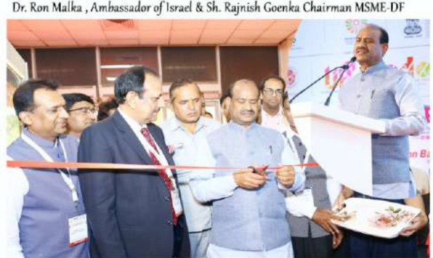
Sh. Om Birla, Speaker of Indian Parliament