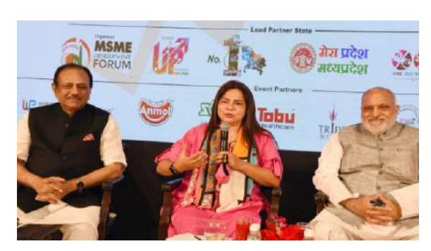
Smt. Meenakshi Lekhi,Minister of State for External Affairs and Culture