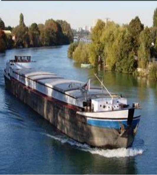
Coastal shipping & IWT