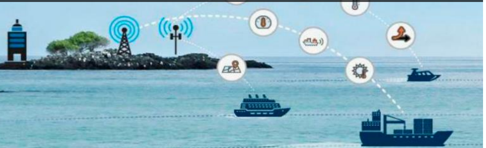
Innovation & technology