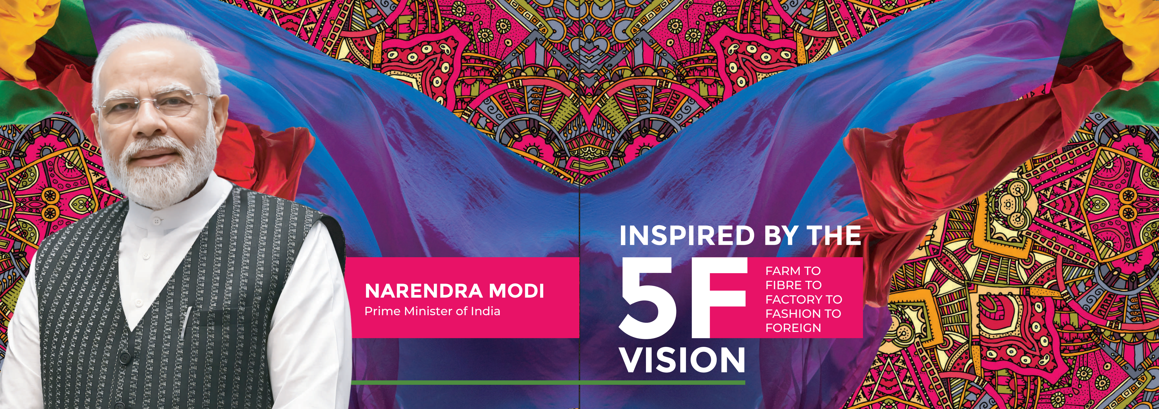
NARENDRA MODI Prime Minister of India

FARM TO FIBRE TO FACTORY TO FASHION TO FOREIGN